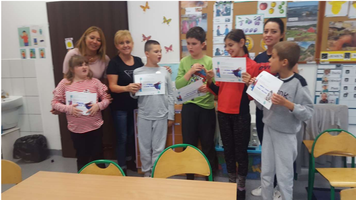
Students in grades II and V of primary school with teachers.