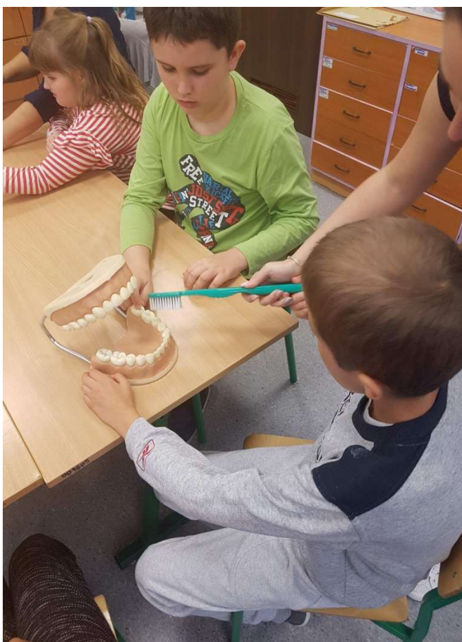
Students in grades II of primary school.

The School Complex in Goleniów is an institution which, according to the core curriculum, in addition to learning specific subjects, introduces activities that promote oral hygiene health so that students can acquire the appropriate knowledge and skills to consciously lead a healthy lifestyle. An example of such activities is supervised brushing of teeth with fluoride preparations.