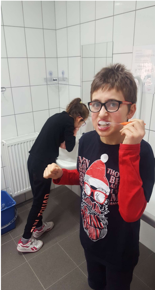
Students in grades IV-VIII of primary school.

Tooth decay is indicated as a modern serious civilization disease. Lifestyle and health behaviors have a huge impact on health.