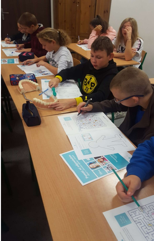
Students in grades I-III of primary school.

In contrast, experiments with chalk and egg made them aware of the importance of brushing teeth with fluoride toothpaste, which protects our teeth. The program was very popular among students. At the end, each participant received an award for a scelebrity smile in the form of a certificate.