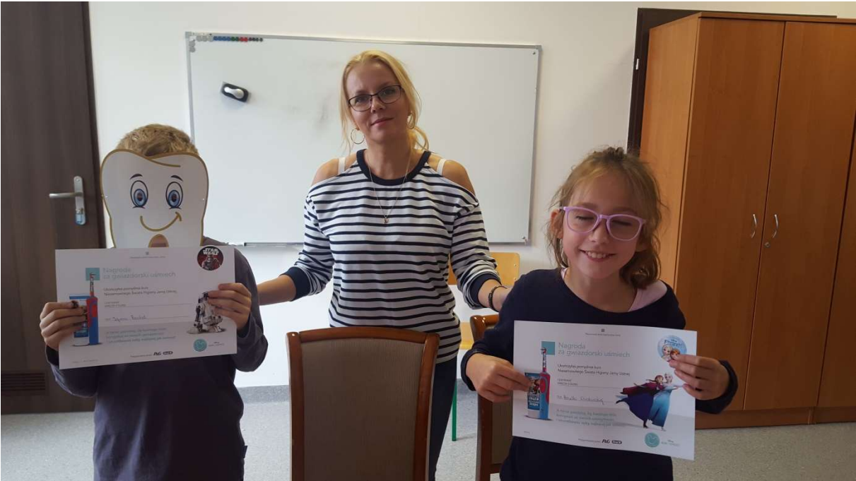
Students in grades IV-VIII of primary school.