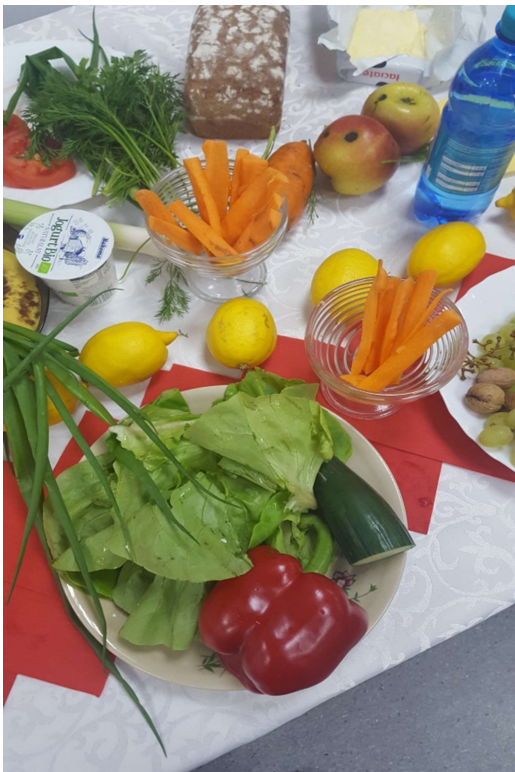
Healthy food for students.