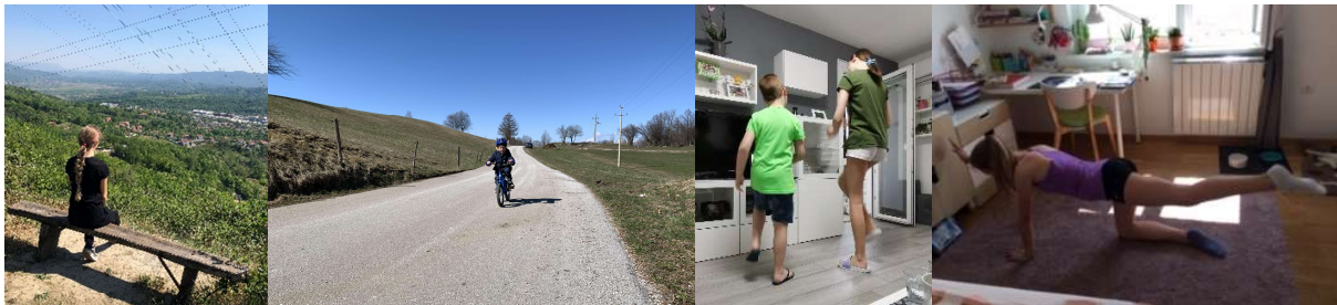
Picture 2. Photos of pupils from sport days.

We had great response and feedback from kids as well as from their parents. They liked the way sports day were planned and carried out, especially because entire family was involved.